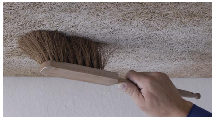
Brushing – Efflorescence, dust, etc. can be removed with a soft brush. Set loose fibres with a commercial grade acrylic primer.