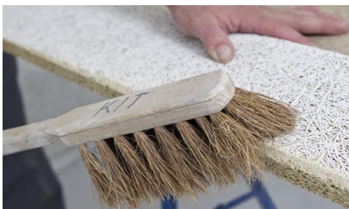
Remove any dust with a soft brush.