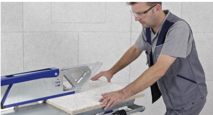
Table saw – Lay the acoustic panel down with the exposed side up. Always work with a safety guard, guide and an extraction system.

Not this way! – Never cut acoustic panels on a stack.