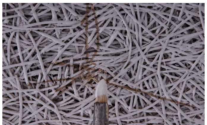
Chipped fibre – Cover chipped fibre with a fine brush or a spray gun using the supplied paint or an equivalent.