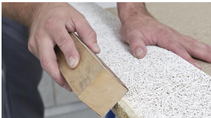
Creating the edge bevel – The bevel is formed with coarse sand paper, belt sander or a saw blade set on an angle.

The paint can be applied with a short-pile paint roller (as described in point b), or by brush. Avoid double painting the tile surface.