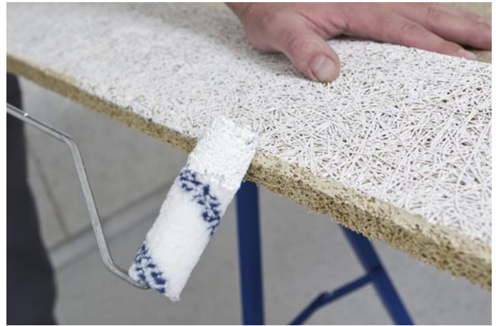
Painting the bevel – Use a brush or a thin paint roller to apply the paint.