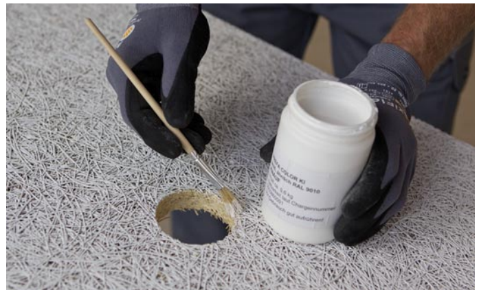
Edge touch-up – Cover cut edges with paint if these are not concealed by a cover.